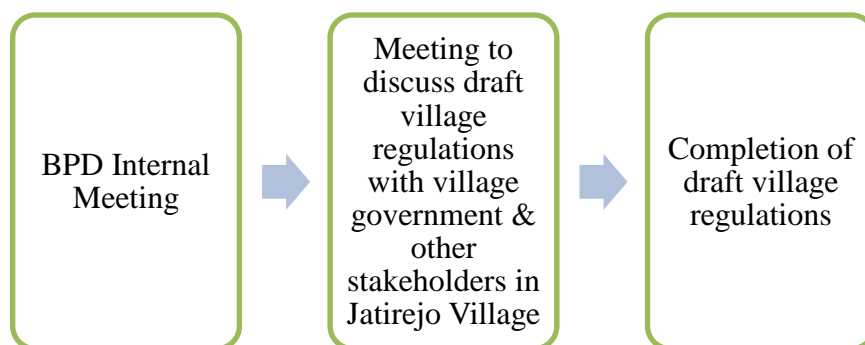
Figure 2 Socio-political stages of Jatirejo Village regulations

The socio-political stage is a continuation of the initiation stage and functions as the second stage in the process of making Jatirejo Village Regulations after the initiation stage. This stage can be considered as a determinant of the quality of the Village Regulations produced. A village regulation will have the quality of a statutory regulation if its contents are appropriate and appropriate to the needs of the village community in the context of the current conditions of the village.