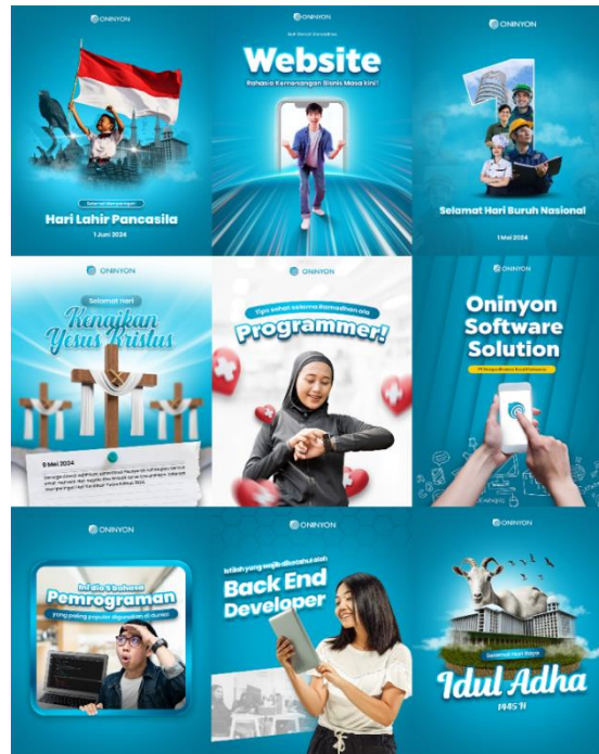
Figure 8. Education Content and Big Day Post Example PT Oninyon Revolusi Kreatif Indonesia

Social media analysis is a process of selecting relevant data for modeling, eliminating noise, filtering quality data, and analyzing it to derive more valuable information (PH Wijana, 2024). This method enables PT. Oninyon to evaluate interaction metrics such as likes, comments, shares, and saves for each post. Understanding the types of content that generate the highest engagement allows the company to refine its design and content strategies. Consistent improvements in engagement metrics demonstrate that the Instagram content design strategies are effective in fostering closer relationships with the audience. This strategy not only increases interaction but also strengthens user loyalty toward the PT. Oninyon Revolusi Kreatif Indonesia brand.