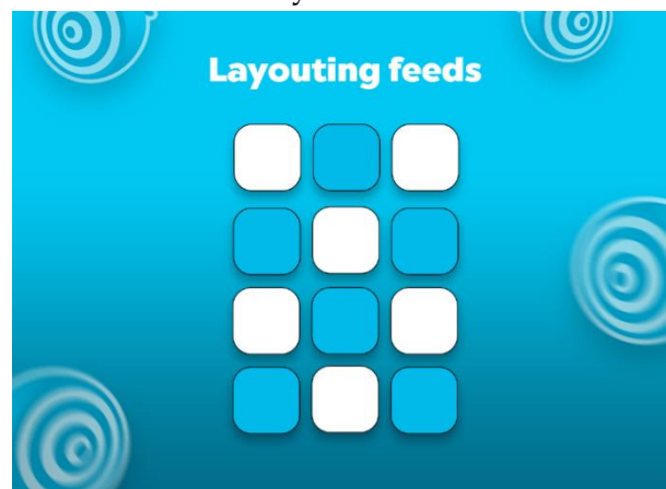
Figure 5. Content Layout Design PT Oninyon Revolusi Kreatif Indonesia

Feed layouting within the design artboard helps designers create an aesthetically pleasing pattern or grid structure for the company's Instagram account. This ensures a cohesive and visually appealing feed that aligns with the brand identity.