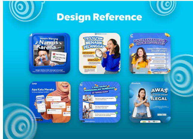
Figure 3. Design Content Reference PT Oninyon Revolusi Kreatif Indonesia

Design references are useful for ensuring consistency in design elements, such as colors, fonts, layouts, and visual styles. They help designers align their work with brand guidelines or specific themes and can also serve as a benchmark to compare the design results against industry standards or trends.