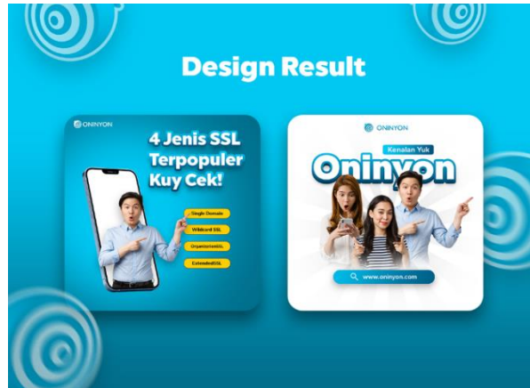
Figure 4. Design Content Results PT Oninyon Revolusi Kreatif Indonesia