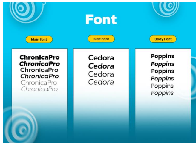
Figure 2. Content Font PT Oninyon Revolusi Kreatif Indonesia

selection, arrangement, and combination of typefaces to create an engaging layout that supports the intended message.