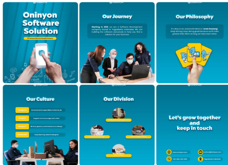
Figure 7. Carousel Post Example PT Oninyon Revolusi Kreatif Indonesia

effectively communicate the brand's message, setting it apart from competitors and reinforcing its position in the market.