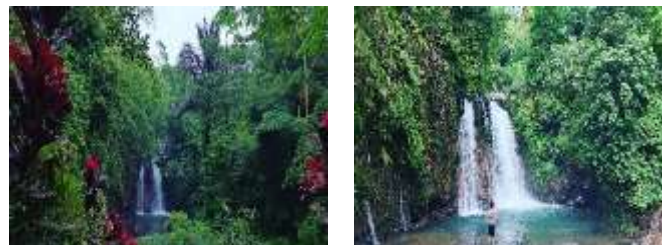
Figure 3 Aspects of the Uniqueness of Natural Resources

The data analysis can be seen in Table 5. The uniqueness of natural resources is also an important factor influencing the tourist experience. The data analysis can be seen in Table 5, as many as 73.33% of respondents were very satisfied and 26.67% were satisfied with the uniqueness of the available resources, with no respondents feeling dissatisfied. This uniqueness can take the form of the waterfall phenomenon itself and the appearance of the natural landscape of the tourist attraction studied, which respondents considered to have its own uniqueness and distinguish it from other places. The existence of this uniqueness adds value to the tourist destination and can be one of the main reasons for visitors to come.