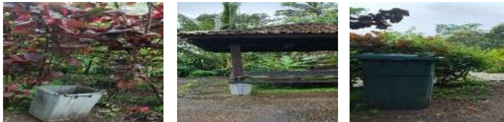
Figure 5 Aspects of Cleanliness

satisfied. However, 13.33% were dissatisfied, and 3.33% were very dissatisfied. These results indicate that while cleanliness is quite good, further optimization is needed, both for the cleaning staff on duty and for the facilities, such as trash bins, which need further attention.