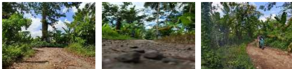
Figure 6 Infrastructure Aspects

The supporting infrastructure of a tourist destination significantly determines visitor comfort and satisfaction. Data analysis, as seen in Table 10, shows that the majority of respondents (80%) were very dissatisfied with the condition of the infrastructure, while only 6.67% were satisfied and 13.33% were dissatisfied. Poor infrastructure, including inadequate roads for both two-wheeled and four-wheeled vehicles, degrades the quality of the tourist experience and reduces its appeal. Therefore, management and the government need to pay serious attention to improving and developing infrastructure, particularly roads, to positively impact visitor visits and tourist satisfaction.