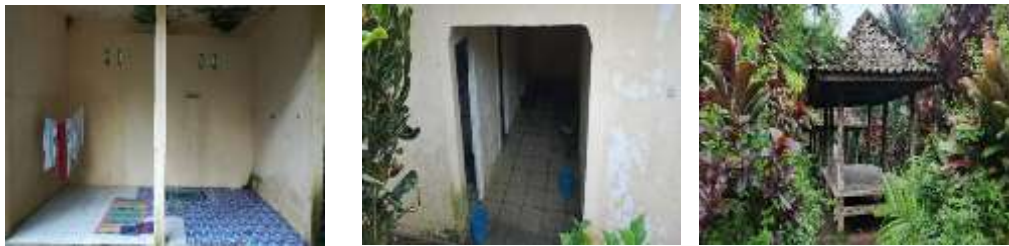
Figure 7 General Facilities Aspects

The high level of dissatisfaction indicates the need for improvements and development of facilities to meet tourist needs. Adequate and well-maintained facilities can increase the duration of visits and increase comfort during their stay. In this regard, Peruvian management needs to improve facilities and provide adequate additional services with the aim of having a positive impact on visitor satisfaction.