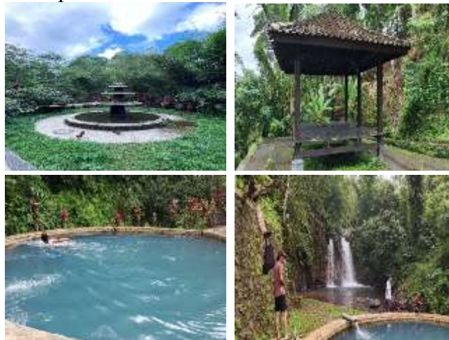
Figure 4 Aspects of Tourism Activity Types

This variety of activities is crucial so that visitors with different interests and preferences can find activities that suit their needs. A variety of activities can also extend the duration of a visit, providing tourists with more options to enjoy. Some of the activities available at the Babak Pelangi Waterfall include bathing or playing in the waterfall, swimming in the pool, relaxing, and a mini garden designed as a photo spot.