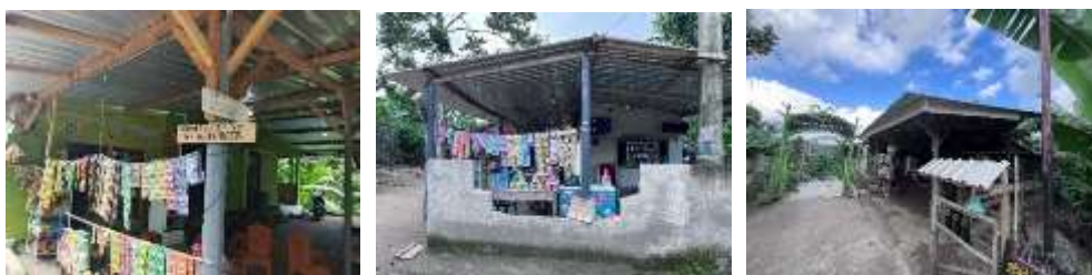
Figure 8 Aspects of Food and Beverage Services

Food and beverage services are an important part of the tourist experience during their visit. From the data analysis conducted, as can be seen in Table 14, the majority of respondents, namely 76.67%, were satisfied with the food and beverage services around the tourist attraction area, while 10% were very satisfied and 13.33% were dissatisfied. Although the majority gave a positive assessment, there was a small portion of dissatisfaction that needs to be considered so that services remain in accordance with visitor expectations both in terms of price and type so that it can improve the experience and satisfaction of tourists, with coordination between managers and food and beverage sellers and providers around the tourist attraction location.