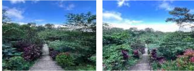
Figure 2 Aspects of Natural Beauty

leave a positive impression on visitors. Natural beauty can be a major attraction that distinguishes this tourist attraction from other places. Beautiful views not only make visitors feel at home but also increase the likelihood of tourists recommending the location to others. Therefore, environmental conservation and efforts to maintain natural beauty are crucial to maintaining visitor satisfaction.