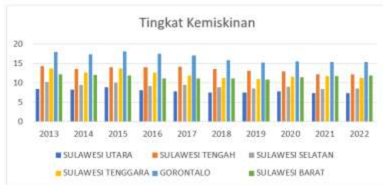
Figure 1: Sulawesi Island's Poverty Rate from 2013 to 2022

Figure 1 below illustrates how the proportion of the impoverished varied by province on the island of Sulawesi between 2013 to 2022. As may be observed, Gorontalo province had the largest percentage of the poor in 2015 (18.16%), while North Sulawesi province had the lowest in 2022 (7.34%).